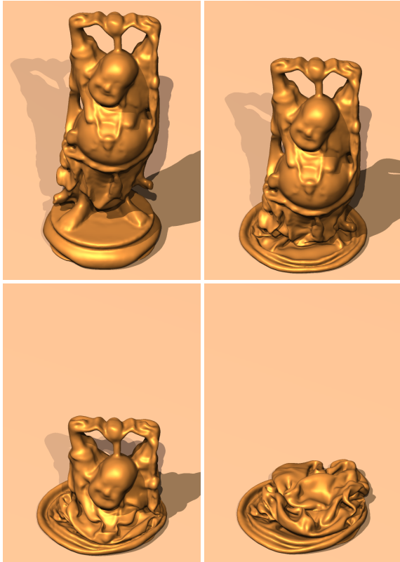
Figure 3: Nonzero rest angles allow pre-sculpted folds, as in this “balloon” Buddha collapsing under its own weight.