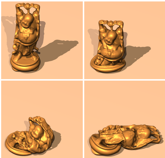
Figure 4: A “water bottle” Buddha with significantly stronger bending resistance that dominates all other elastic forces, illustrating that our formulation is well behaved in the stiff limit, robust across a wide range of materials.